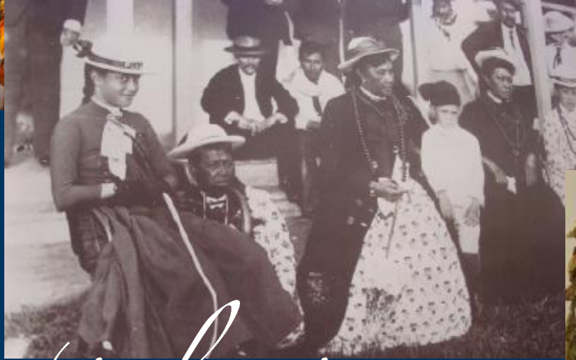
1) Feather kähili are symbols of high rank 2) Ka'iulani and 'ohana visiting the Cummins ranch, "Mauna Loke," in Waimānalo, 1880s 3) A mature Ka'iulani in Victorian fashion.